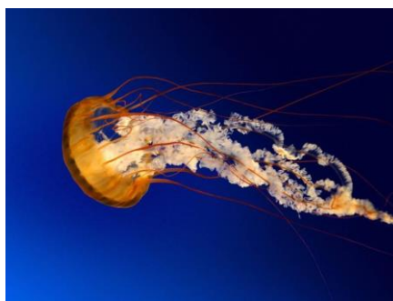
Fig. 1. Sea Bokeh Ocean Underwater Jellyfish